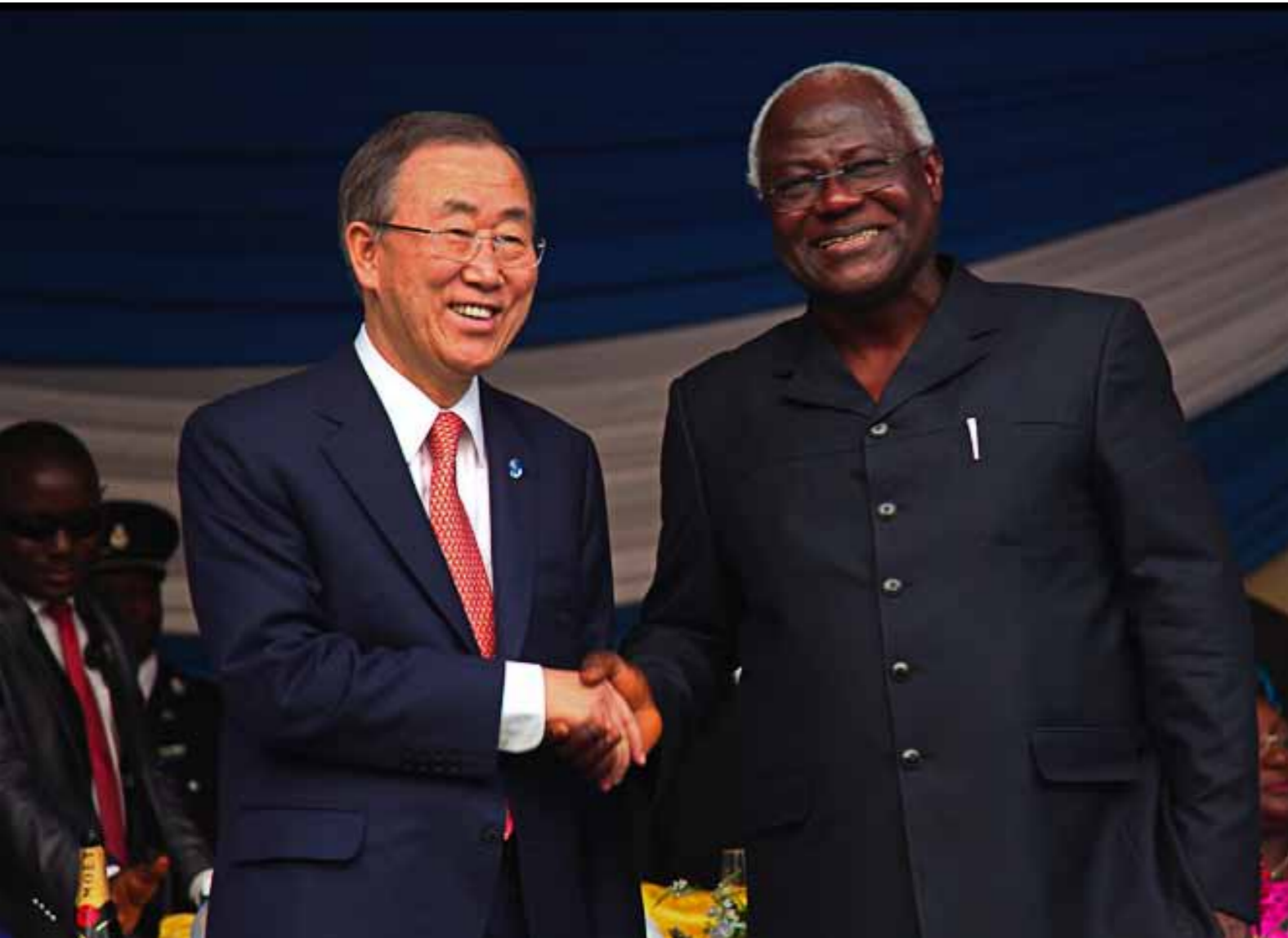
United Nations Secretary-General Ban Ki-moon visited Sierra Leone on 4-6 March 2014 to mark the closing of the United Nations Integrated Peacebuilding Office in Sierra Leone (UNIPSIL) after fifteen years of successive UN peace and political operations and highlight the transition to a United Nations presence focused on development.