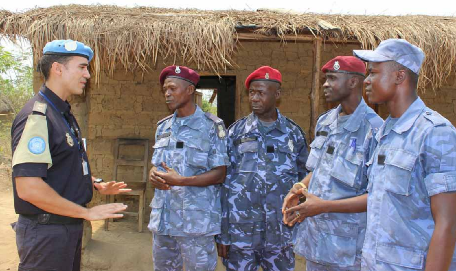
A United Nations Police officer meets with Sierra Leonean forces to discuss border issues.