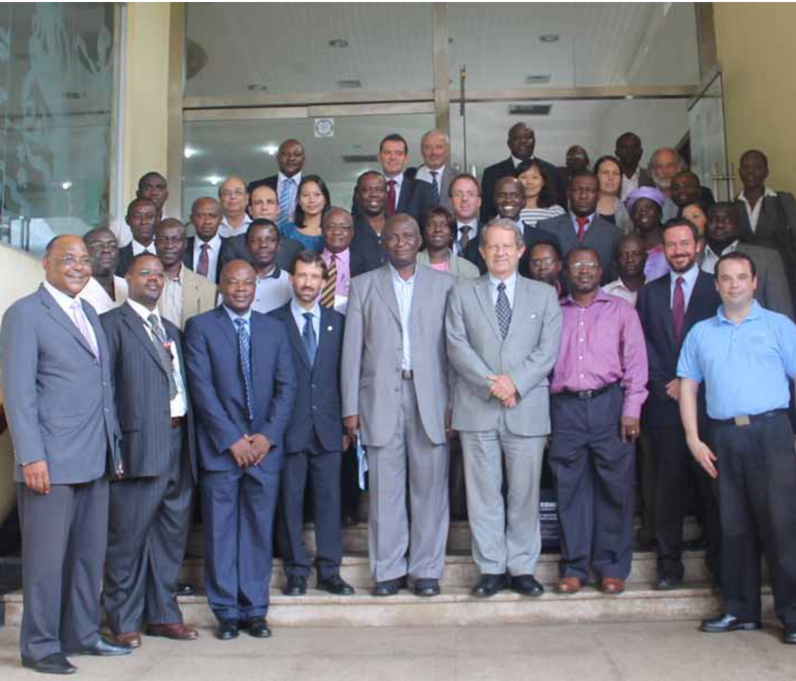
Government, UN Country Team and UN Staff College participants at the UNDAF Strategic Planning Workshop.